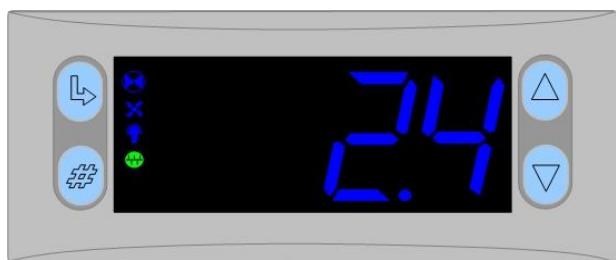
Mercury 2 Remote Display